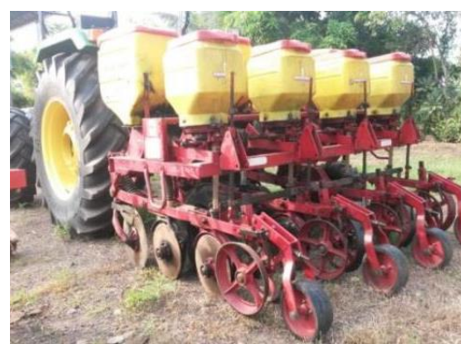
Versatile no-till planter