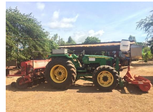
NT planter, broadcaster & roller crimper