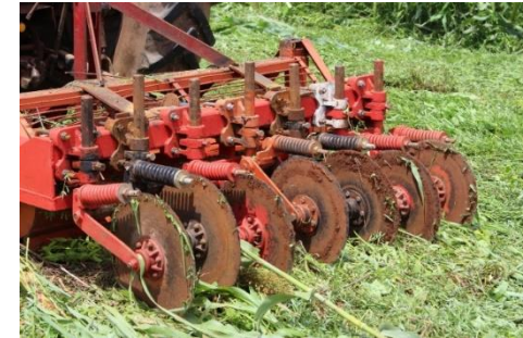
Roller with cutting disc