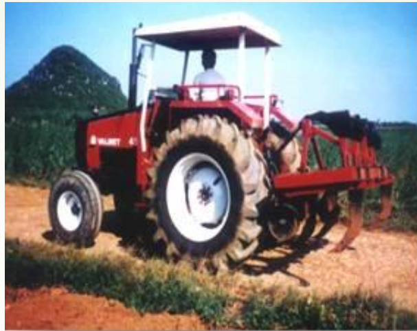
Deeply flush 5-blade land