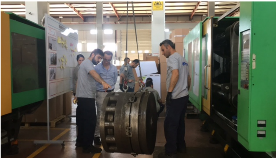
Training Programme for improvement of manufacturing skills, March & December 2017

To improve its members' administrative and technical capacity, TARMAKBİR organizes training programs