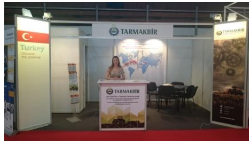
Novi Sad, Serbia, May 2015