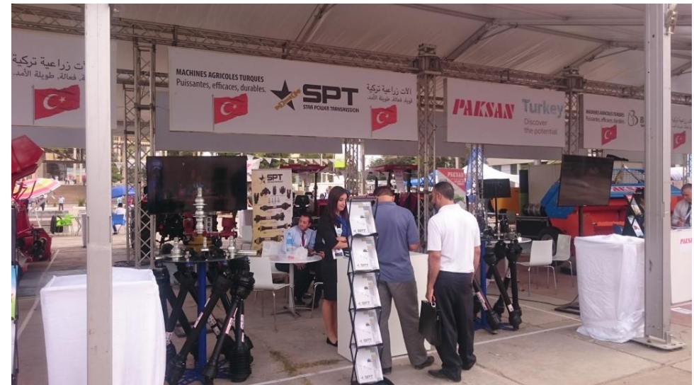
SIMA-SIPSA Exhibition participation Algiers, Algeria, October 2016