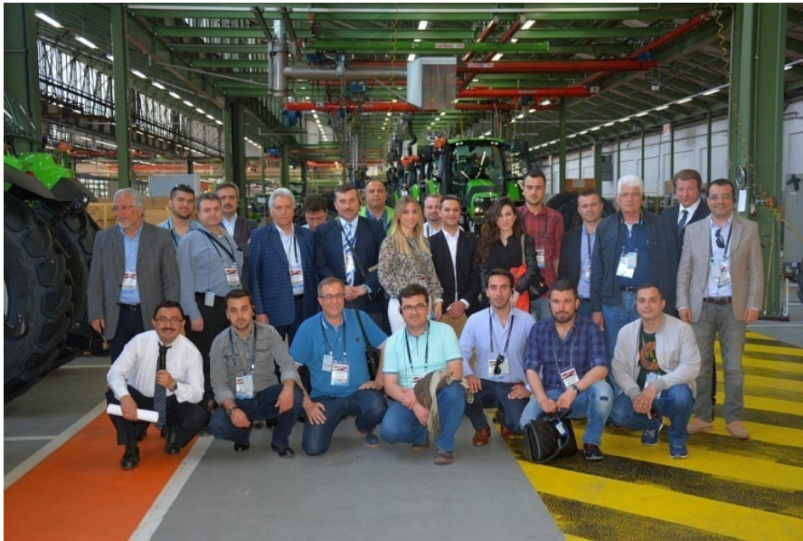
Fendt Tractor Factory visit, Marktoberdorf, Germany, 2015

To improve and pursue communication and collaboration with foreign ag machinery manufacturers, TARMAKBİR organizes for its members abroad factory visit trips