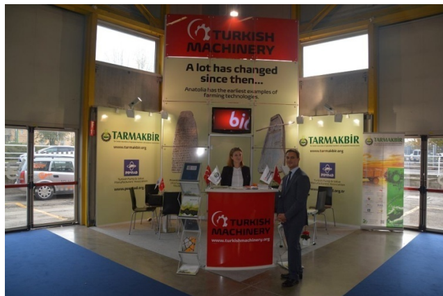
EIMA Bologna, Italy, Nov 2014

TARMAKBİR participates in national & international trade shows to introduce its members and Turkish Agriculture Machinery Industry