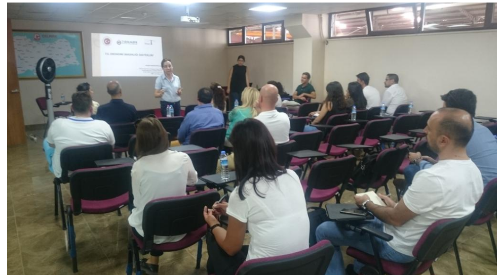
Training Programme for improvement of foreign trade skills, July 2016