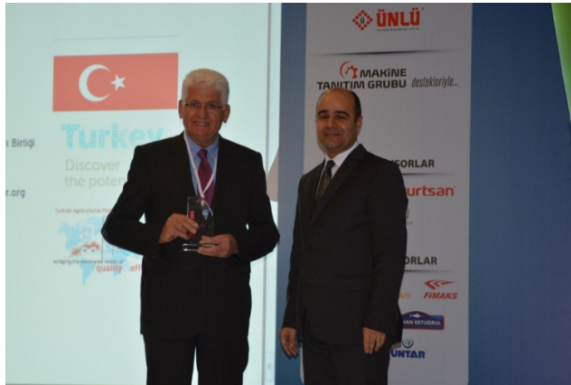
The 9th Ag. Machinery Industry Meeting, 2015

Every year in autumn, TARMAKBİR organizes a meeting in Antalya, Turkey where industry stakeholders from public & private bodies, universities, institutions, and member companies gather