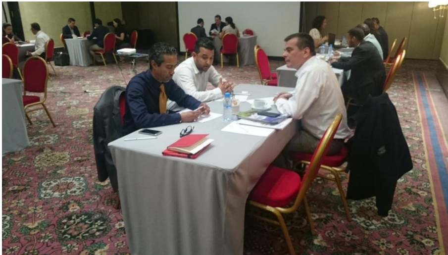
Business meeting with Moroccan companies, Casablanca, Morocco, April 2017

To improve exports and business collaborations of its members, TARMAKBİR organizes trade delegations and trade show participations in foreign countries