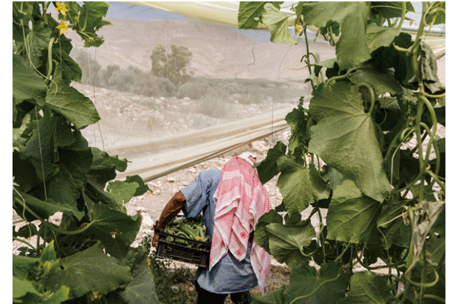
A farmer picks vegetables from a greenhouse in rural Jordan.

http://www.un.org/apps/news/story.asp?NewsID=56728#.WT4zsROGOu4