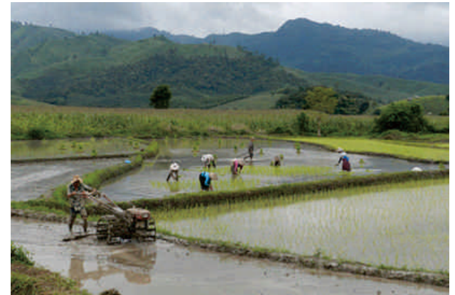
Tending paddy fields in Laos.

http://www.un.org/apps/news/story.asp?NewsID=56740#.WT4zsROGOu4