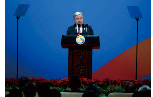
Secretary-General António Guterres addresses the opening of the Belt and Road Forum in Beijing, China.