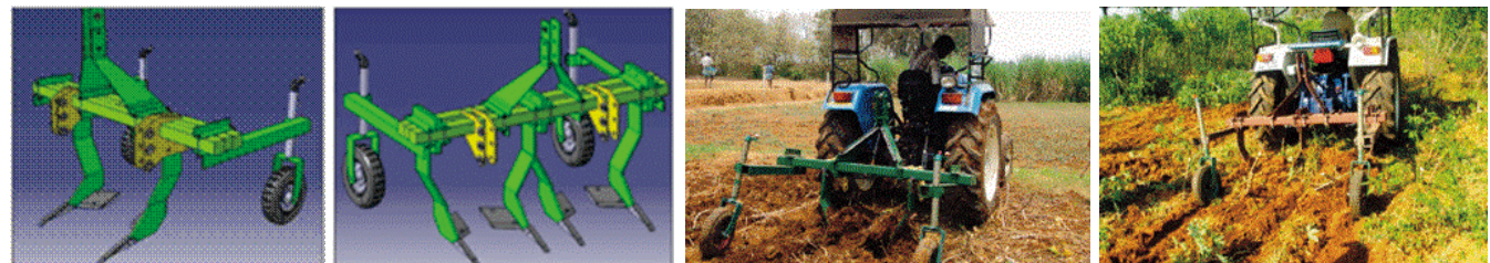
Fig. 1. Tractor operated single and two row cassava harvesters

Source: This article was extracted from Success Stories...2016 published by All India Coordinated Research Project (AICRP) on Farm Implements and Machinery (FIM), Central institute of Agricultural Engineering, India (ICAR) in 2016. To learn more about machinery developed by AICRP on FIM, ICAR-CIAE, Bhopal visit: http://aicrp.icar.gov.in/fim/success-stories/