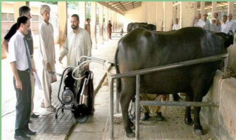
Milking Machine for Buffaloes (0.15m)