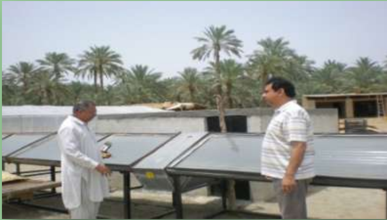
Solar-cum-Gas Fired Dates Dryer