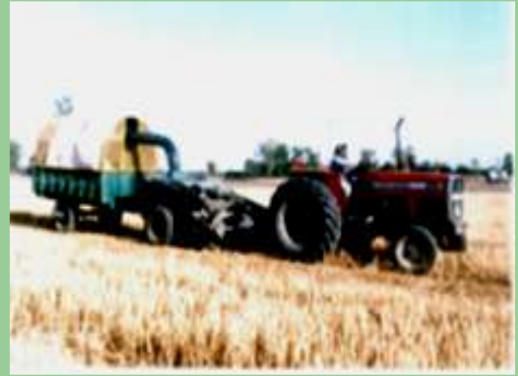
Wheat Straw Chopper Blower