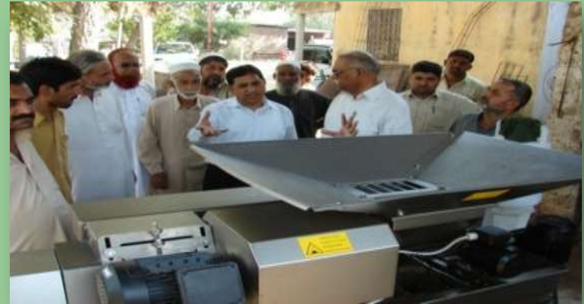
Olive Oil Extraction Unit (0.6m)