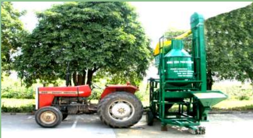
Mobile Seed Processing Unit