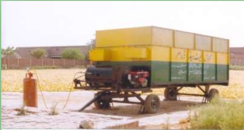
Mobile Flat-bed Dryer (0.7m)