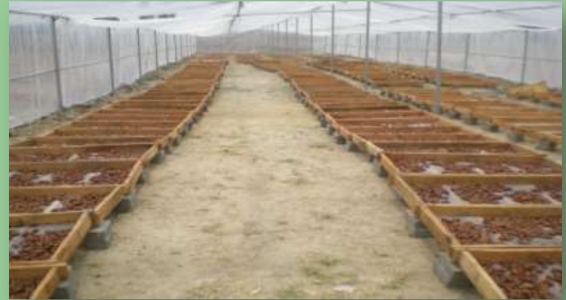
Solar House Dates Dryer