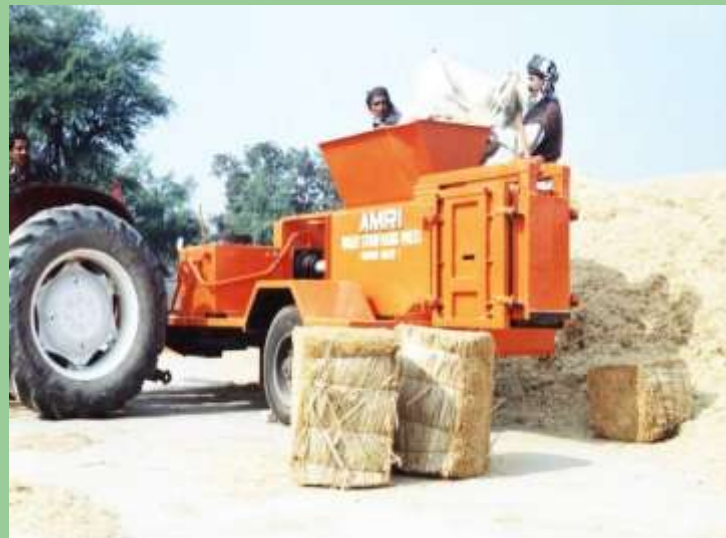
Mobile Bhoosa Baler