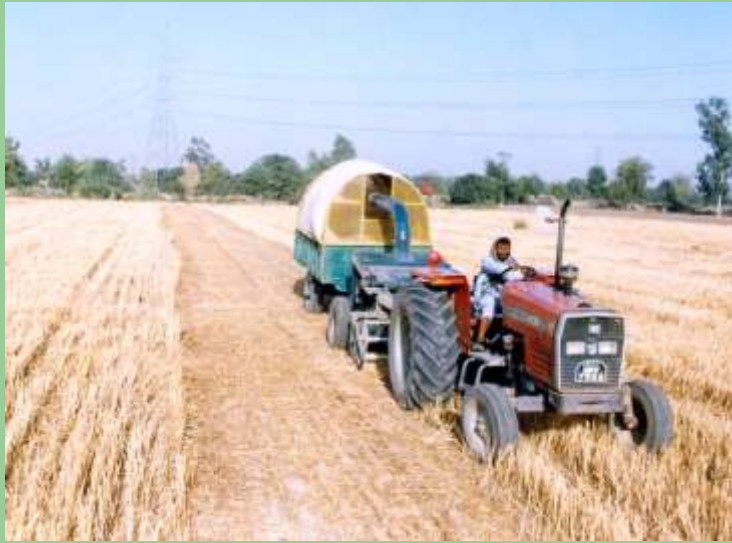
Wheat Straw Chopper Blower